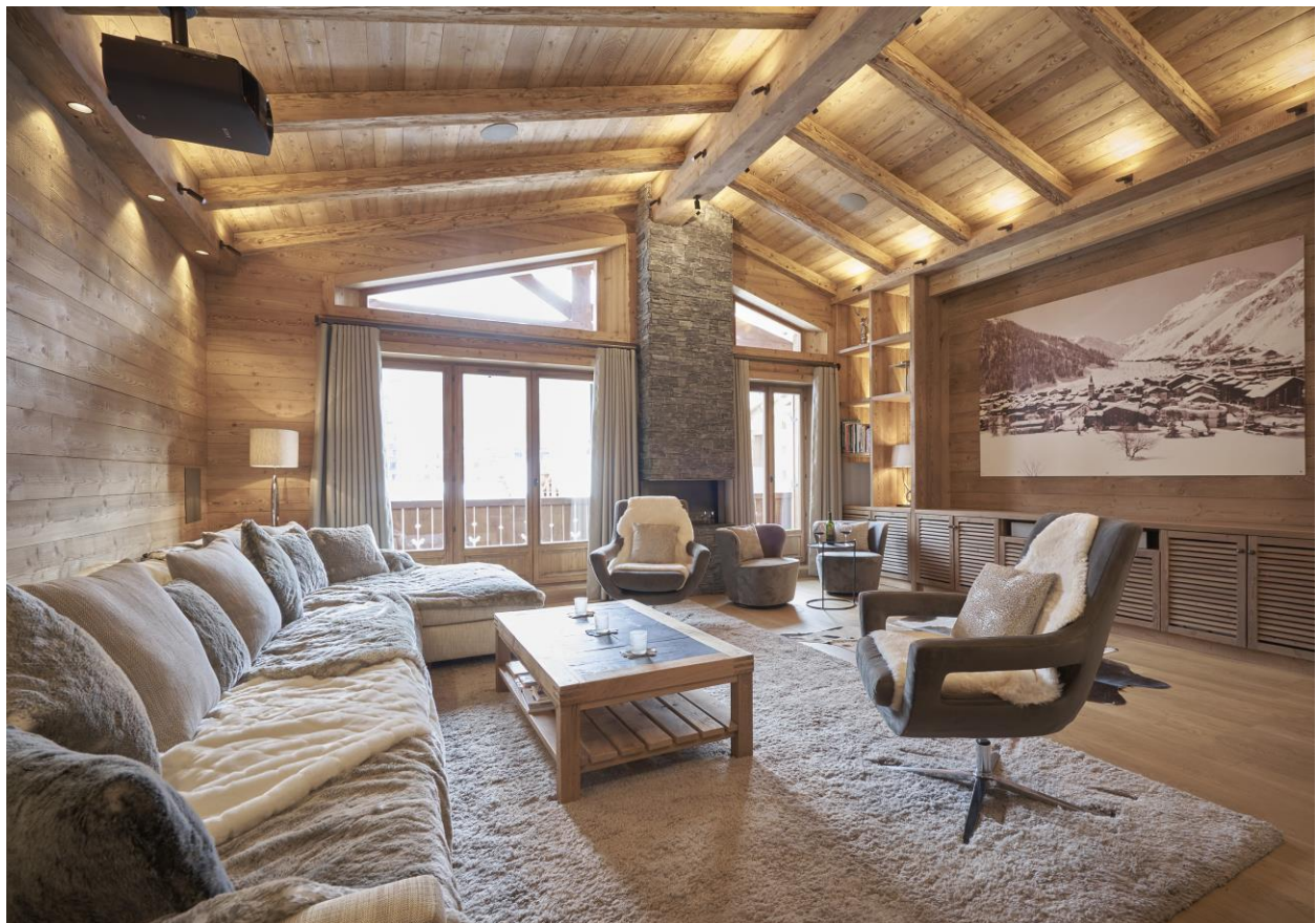
Fabulous vaulted sitting room in Choucas Penthouse

Available to book: 'Scatered', Self-Catered or B&B