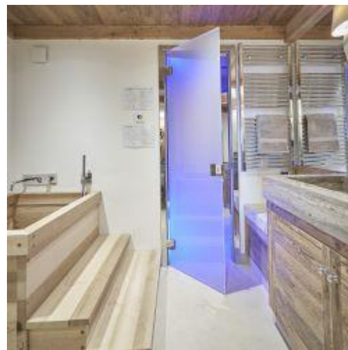
Japanese Soaking tub

A balcony runs off the side of the building with access from all 3 bedrooms.