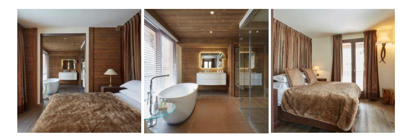
The 2 further twin/double bedrooms are down the corridor.

The master suite has the bedroom to one end which opens onto a spacious bathroom with freestanding oval bath, separate shower, double basins and ample storage. The WC is in a separate room within the bathroom.