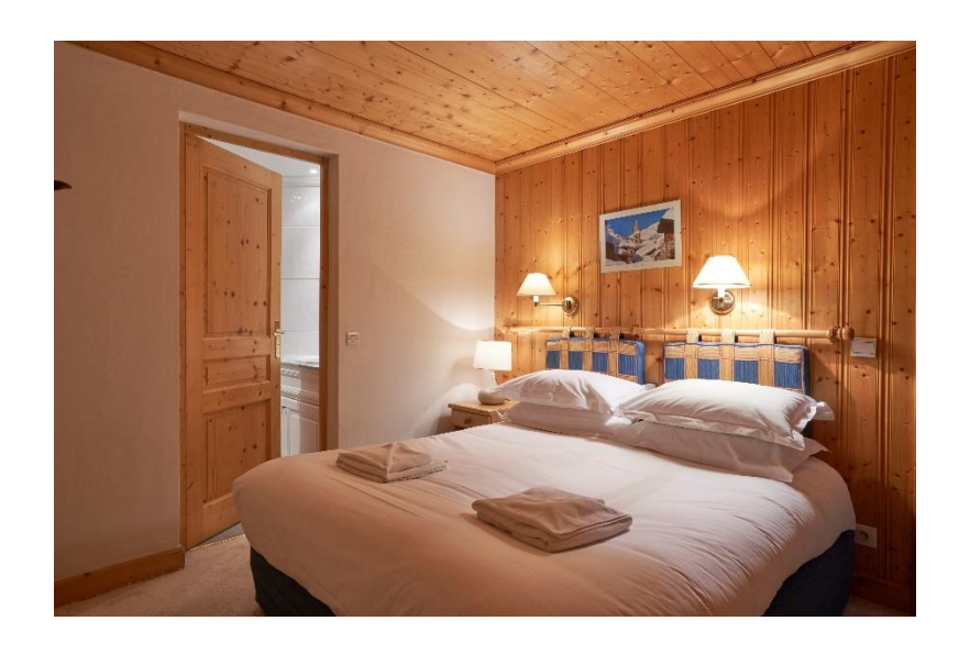
Bedroom 3; twin or double room with ample storage and a bathroom opposite the hall, dedicated to this bedroom. It has a bath with glass panel and wall mounted shower attachment, double sinks and heated towel rail. A separate WC is in the hallway too.